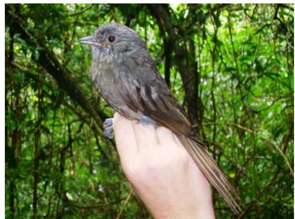
Figure 3. Lipaugus lanioides is an endemic species of Atlantic forest occurring at Ilha Grande, state of Rio de Janeiro, Brazil.

Atlantic forest remnants at Ilha Grande, as well as Itatiaia (states of Rio de Janeiro and Minas Gerais), can be two remarkable Atlantic forest remnants for Pyroderus scutatus , whose populations are much reduced in Southeast Brazil (Sick 1997).