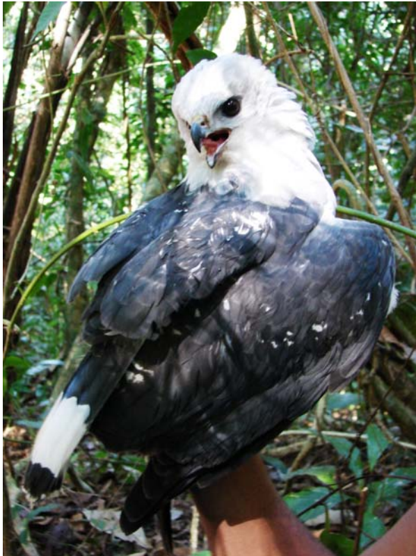
Figure 5. Leucopternis lacernulatus is a threatened and endemic bird of Atlantic forest at Ilha Grande, state of Rio de Janeiro, Brazil.

rhodocorytha ) and four were recorded only at Ilha de São Sebastião [ Pipile jacutinga (Spix, 1825), Touit surdus (Kuhl, 1820), Myrmotherula minor Salvadori, 1864 and Neopelma chrysolophum Pinto, 1944].