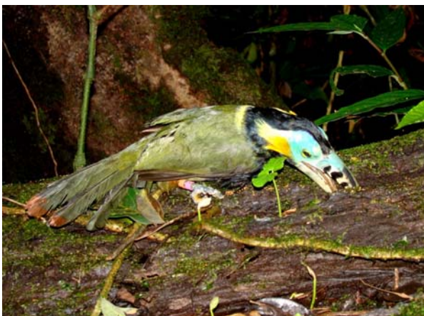
Figure 4. Selenidera maculirostris is an endemic species of Atlantic forest occurring at Ilha Grande, state of Rio de Janeiro, Brazil.

most frequently captured in the understory of the least disturbed forest during these systematic long-term studies (Alves 2001; Alves 2007). This kind of data allows evaluations of the population numbers over the years and between years (Alves 2007). Other species frequently captured and recorded based on sightings or vocalizations were Chiroxiphia caudata (Shaw & Nodder, 1793) and Trichothraupis melanops (Vieillot, 1818). One example of a species not regularly recorded is Haplospiza unicolor Cabanis, 1851, captured only six years after starting our mist netting study (Alves 2007). This last species is endemic of Atlantic forest, feeds on bamboo seeds, and is usually detected during the flowering and fructification of these plants (Olmos 1996b). Species eventually captured but with no visual or vocal record were Pionopsitta pileata (Scopoli, 1769), Elaenia mesoleuca (Deppe, 1830) and Phyllomyias fasciatus (Thunberg, 1822). We did not record any species based only on vocal record, except Grallaria varia (Boddaert, 1783), and Nyctibius griseus (Gmelin, 1789), which we have no doubt in terms of vocal identification.