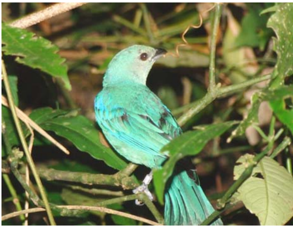
Figure 2. Thraupis cyanoptera is an endemic species of Atlantic forest occurring at Ilha Grande, state of Rio de Janeiro, Brazil.

A total of 175 bird species were encountered at Ilha Grande during the primary surveys. An additional 47 species were obtained from secondary data from other authors (Maciel et al. 1984; Maciel and Pacheco 1995; Coelho et al. 1991; Pacheco et al. 1997; Buzzetti 2000; Raposo et al. unpublished data; Maciel unpublished data), including data from other locations at Ilha Grande besides the ones we sampled (Table 1). This represents 222 bird species from 58 families.